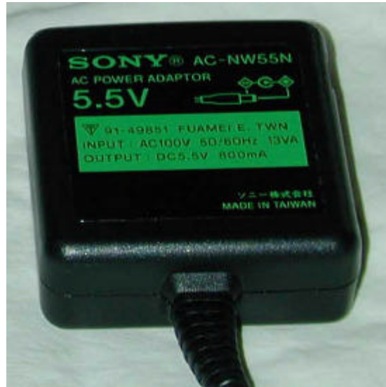
Figure 1– Example of Power Supply Nameplate Output Voltage and Current

Additional load conditions may be selected at the technician's discretion, as described in IEEE 1515-2000, but are not required by this test procedure.